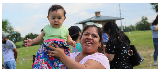
Spring in the Park

On April 27, 2019, The Warren Center hosted a Spring in the Park event for children and their families to celebrate spring in a sensory-friendly way. Families enjoyed fun activities including a bubble bus.