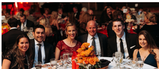
Art of Music

On February 23, 2019, The Warren Center held its third annual Art of Music Gala. The one of kind event featured musical performances and original art from renowned musicians and visual artists.