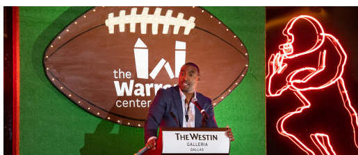
Fantasy Football Draft Night

On August 23, 2019, The Warren Center held its 26th annual Fantasy Football Draft Night with celebrity host Darren Woodson. Guests enjoyed drafting their own Fantasy Football team as well as live music and more.